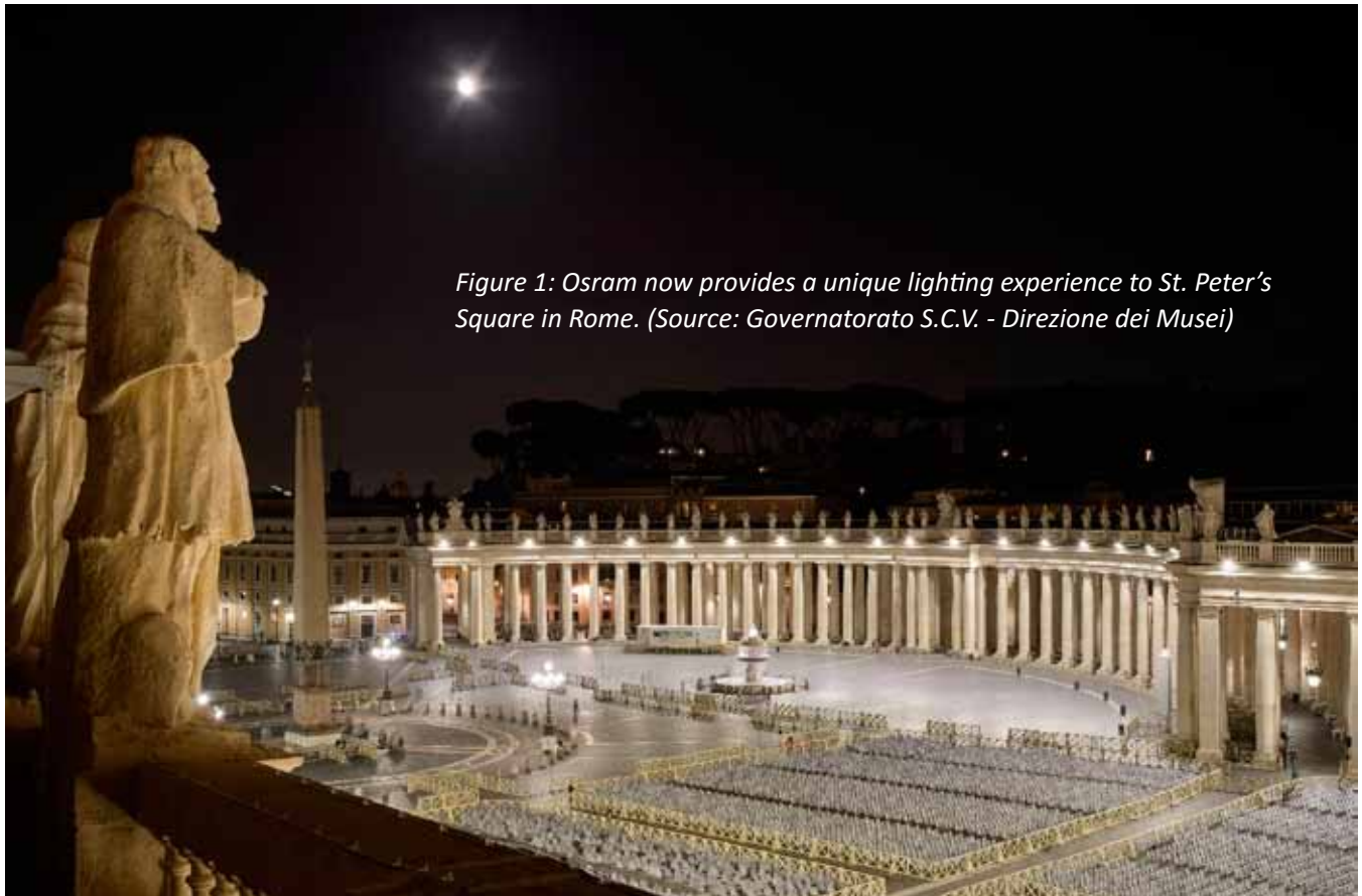
Figure 1: Osram now provides a unique lighting experience to St. Peter's Square in Rome.

The continued focus on improvements in efficiency regarding lumens per square millimeter ( \text{lm}/\text{mm}^2 ), as well as lumens per Watt ( \text{lm}/\text{W} ). This is important, as lighting manufacturers now look to improve subsequent generations of currently successful products: newer, better devices within the same footprint as their predecessors allow new products to be introduced quickly and cost-effectively without requiring a major redesign. Cree introduced the latest generation of its benchmark high-power XP-L emitter in September,