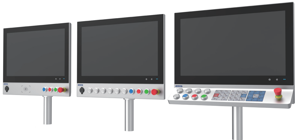
Advantech SPC-800 series

Advantech’s SPC-800 is an industrial HMI that follows recent trends for a touchscreen interface combined with a few physical buttons. The SPC-800 accommodates user preferences for physical buttons while providing a touchscreen for more efficient operation, integrating the two interface types to optimize operational safety and ensure efficient processing.